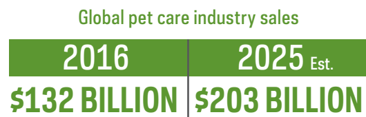
Growth and other pet industry trends may not continue or may reverse.

Corporate interest is intensifying, too. More than 80 mergers and acquisitions over the past 12 months indicate that a wide range of companies is attracted to and investing in this dynamic opportunity.