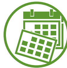
Uninterrupted dividend growth over time