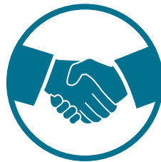
Demonstrated commitment to shareholders