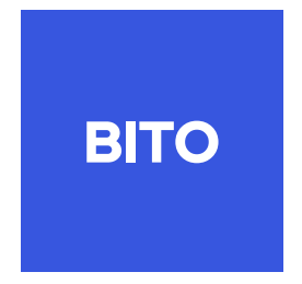
Bitcoin Strategy ETF