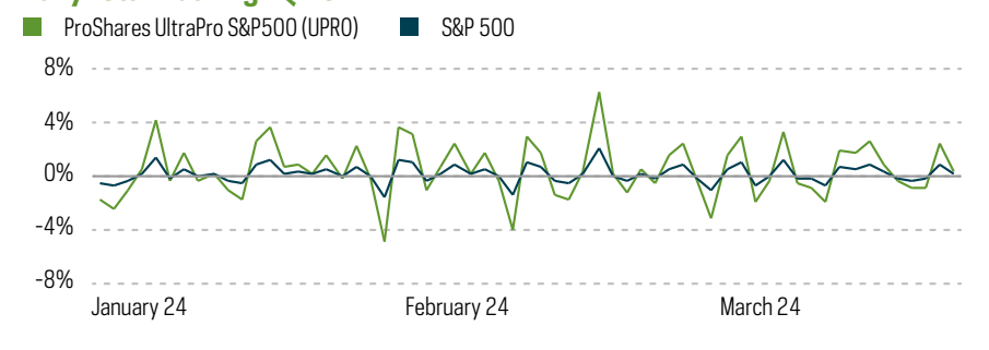
Daily return during 10 2024

The performance quoted represents past performance and does not guarantee future results. Investment return and principal value of an investment will fluctuate so that an investor's shares, when sold or redeemed, may be worth more or less than the original cost. Current performance may be lower or higher than the performance quoted. Performance data current to the most recent month-end may be obtained by calling 866.776.5125 or visiting ProShares.com. Index performance does not reflect any management fees, transaction costs or expenses. Indexes are unmanaged and one cannot invest directly in any index. Carefully consider the investment objectives, risks, charges and expenses of ProShares before investing. This and other information can be found in their summary and full prospectuses. Read them carefully before investing. Obtain them from your financial professional or visit ProShares.com. ProShares are not suitable for all investors.