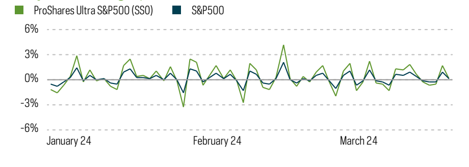
Daily return during 10 2024

The performance quoted represents past performance and does not guarantee future results. Investment return and principal value of an investment will fluctuate so that an investor's shares, when sold or redeemed, may be worth more or less than the original cost. Current performance may be lower or higher than the performance quoted. Performance data current to the most recent month-end may be obtained by calling 866.776.5125 or visiting ProShares.com. Index performance does not reflect any management fees, transaction costs or expenses. Indexes are unmanaged and one cannot invest directly in any index.