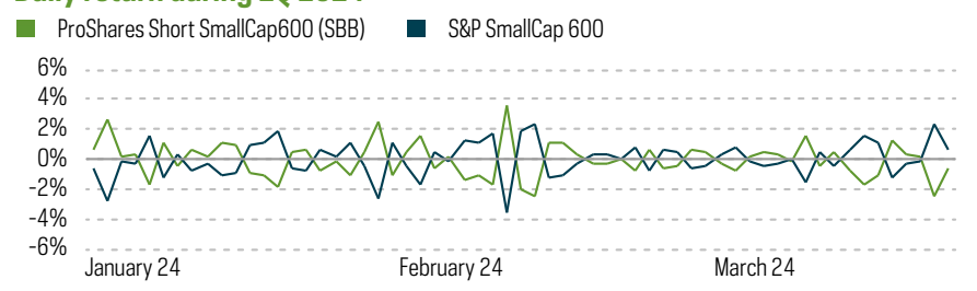
Daily return during 10 2024

The performance quoted represents past performance and does not guarantee future results. Investment return and principal value of an investment will fluctuate so that an investor's shares, when sold or redeemed, may be worth more or less than the original cost. Current performance may be lower or higher than the performance quoted. Performance data current to the most recent month-end may be obtained by calling 866.776.5125 or visiting ProShares.com. Index performance does not reflect any management fees, transaction costs or expenses. Indexes are unmanaged and one cannot invest directly in any index.