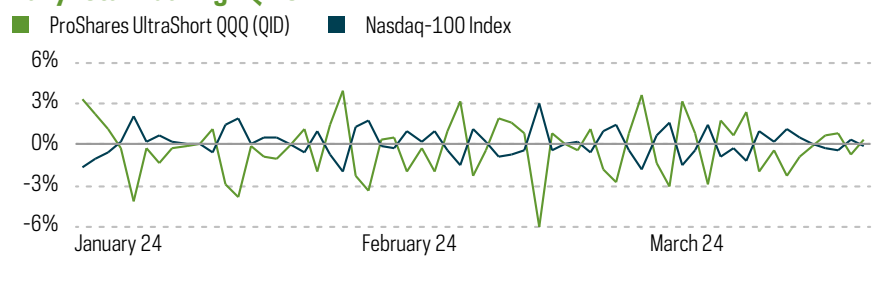
Daily return during 10 2024

The performance quoted represents past performance and does not guarantee future results. Investment return and principal value of an investment will fluctuate so that an investor's shares, when sold or redeemed, may be worth more or less than the original cost. Current performance may be lower or higher than the performance quoted. Performance data current to the most recent month-end may be obtained by calling 866.776.5125 or visiting ProShares.com. Index performance does not reflect any management fees, transaction costs or expenses. Indexes are unmanaged and one cannot invest directly in any index.