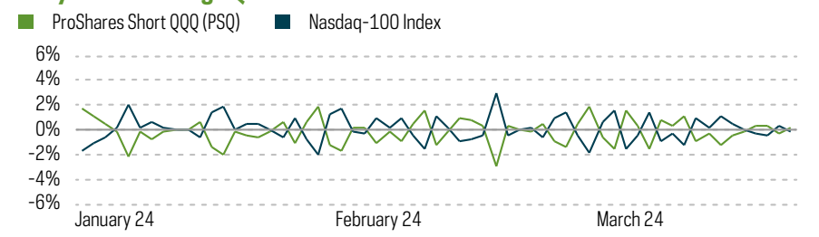
Daily return during 10 2024

The performance quoted represents past performance and does not guarantee future results. Investment return and principal value of an investment will fluctuate so that an investor's shares, when sold or redeemed, may be worth more or less than the original cost. Current performance may be lower or higher than the performance quoted. Performance data current to the most recent month-end may be obtained by calling 866.776.5125 or visiting ProShares.com. Index performance does not reflect any management fees, transaction costs or expenses. Indexes are unmanaged and one cannot invest directly in any index.