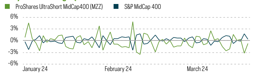
Daily return during 10 2024

The performance quoted represents past performance and does not guarantee future results. Investment return and principal value of an investment will fluctuate so that an investor's shares, when sold or redeemed, may be worth more or less than the original cost. Current performance may be lower or higher than the performance quoted. Performance data current to the most recent month-end may be obtained by calling 866.776.5125 or visiting ProShares.com. Index performance does not reflect any management fees, transaction costs or expenses. Indexes are unmanaged and one cannot invest directly in any index.